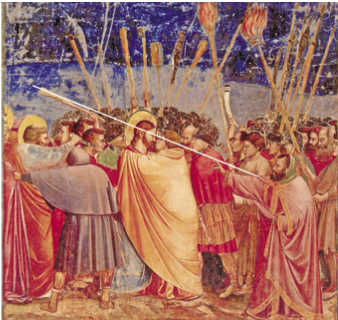
Picture 3. Giotto, The capture of Christ, about 1305. Padua, Arena-Kapelle (from: Imdahl, 1996a, Abbildungsverzeichnis, p. 45, the slanting line was drawn by me according to Imdahl)

The iconic meaning, which is Max Imdahl's term for this deeper semantic structure, has — according to Imdahl — its peculiarity in a «complexity of meaning which is characterized by transcontrariness» (in German: «eine Sinnkomplexität des Übergegensätzlichen») (Imdahl, 1996a, p. 107).