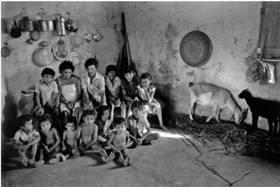
Picture 1. Sebastião Salgado: Family with eleven children in Sertão de Tauá. Ceará 1983 (from: Sebastião Salgado, 1997, p. 98)