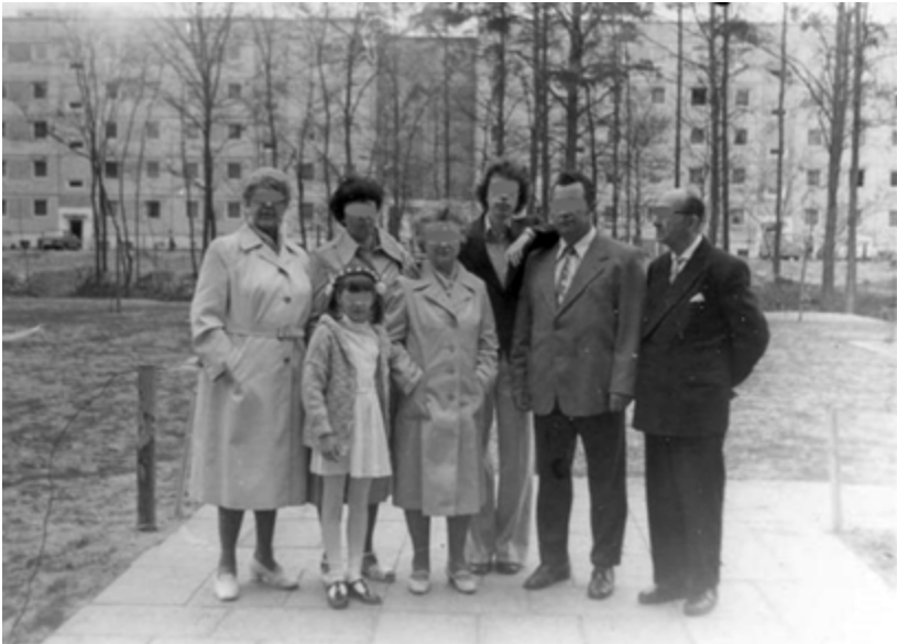
Picture 4. Family photo