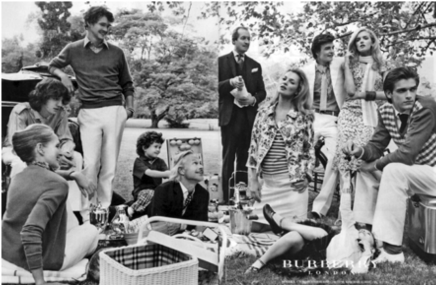
Picture 6. Advertising photo I: Burberry London. From Vogue 2005 Russia

As another example of such a «complexity of meaning characterized by transcontrariness» and as an example of the importance of formal structure, I would like to present a quite different family photo to you (see Picture 6): here we have an advertising photo from the clothing company Burberry, which is meant to target markets in Russia and the USA.