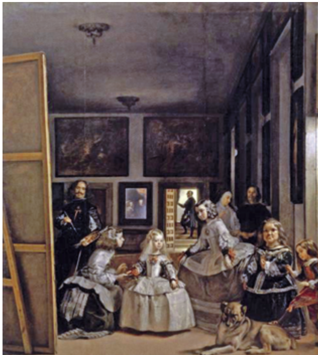
Picture 2. Diego Velázquez: Las Meninas, 1656. Madrid, Museo del Prado (from GREUB, 2001, p. 295)

The decoding of a message which can be imparted exclusively by a picture thus must always go through iconographical or connotative code. However, the message must «get rid of its connotations» as Roland Barthes (Barthes, 1991, p. 31) has put it, and «is first of all a residual message, constituted by what remains in the picture when we (mentally) erase the signs of connotation» 6 .