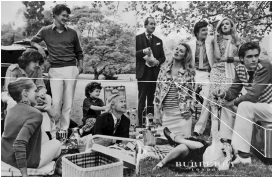
Picture 10. Advertising photo I: Burberry London: perspective. (lines were drawn by me)