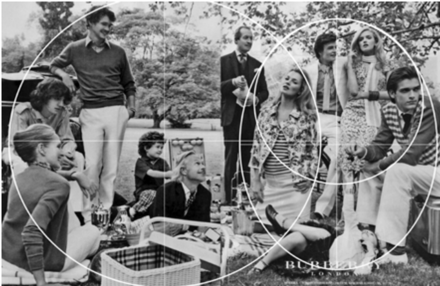
Picture 7. Advertising photo I: Burberry London: planimetry. (lines were drawn by me)

As another example of such a «complexity of meaning characterized by transcontrariness» and as an example of the importance of formal structure, I would like to present a quite different family photo to you (see Picture 6): here we have an advertising photo from the clothing company Burberry, which is meant to target markets in Russia and the USA.