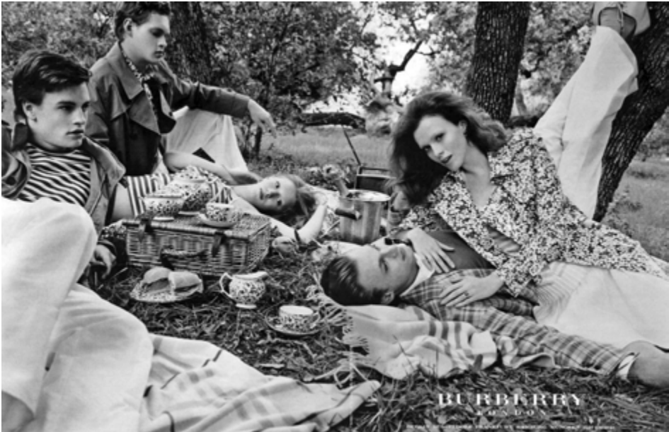
Picture 8. Advertising photo II: Burberry London: planimetry.

However, we recognize that the presentation of individuality and autonomy has taken the specific form of a negation. This is due to the peculiar form of presentation in advertising. Advertising depends on the medium of the pose (see also: Bohnsack, 2007b a; Imdahl, 1996c), the «hyper-ritualization» as Erving Goffman (Goffman, 1979, p. 84) has called it, and is confronted with the paradoxical challenge of expressing individuality through the medium of poses and stereotypes. In our case, this is accomplished through the absence or denial of visual contact. This effect is even more evident in the photo which is intended for the German advertising market (see Picture 8).