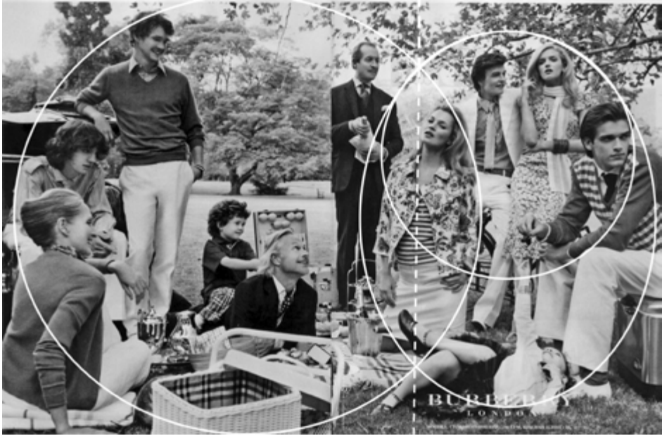
Picture 9. Advertising photo I: Burberry London planimetry and golden section.

Thus the photo demonstrates yet another form of transcontrariness in its iconic or iconological meaning: the presentation of individuality by posing or using stereotyped postures.