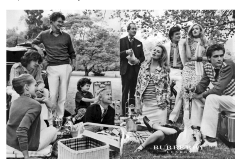
Picture 6. Advertising photo I: Burberry London. From Vogue 2005 Russia

As another example of such a «complexity of meaning characterized by transcontrariness» and as an example of the importance of formal structure, I would like to present a quite different family photo to you (see Picture 6): here we have an advertising photo from the clothing company Burberry, which is meant to target markets in Russia and the USA.