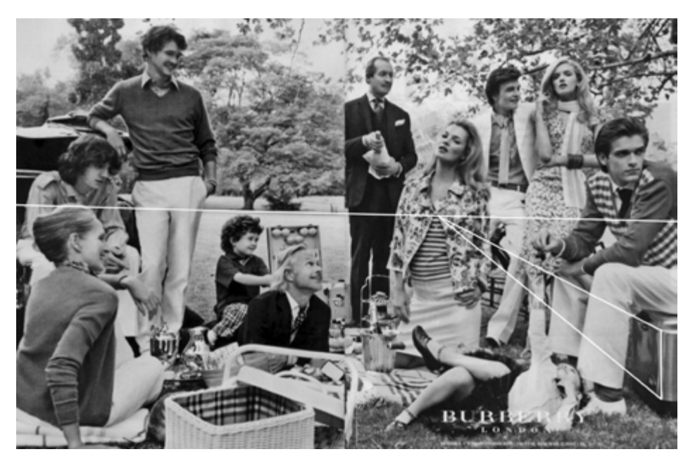
Picture 10. Advertising photo I: Burberry London: perspectivity. (lines were drawn by me)