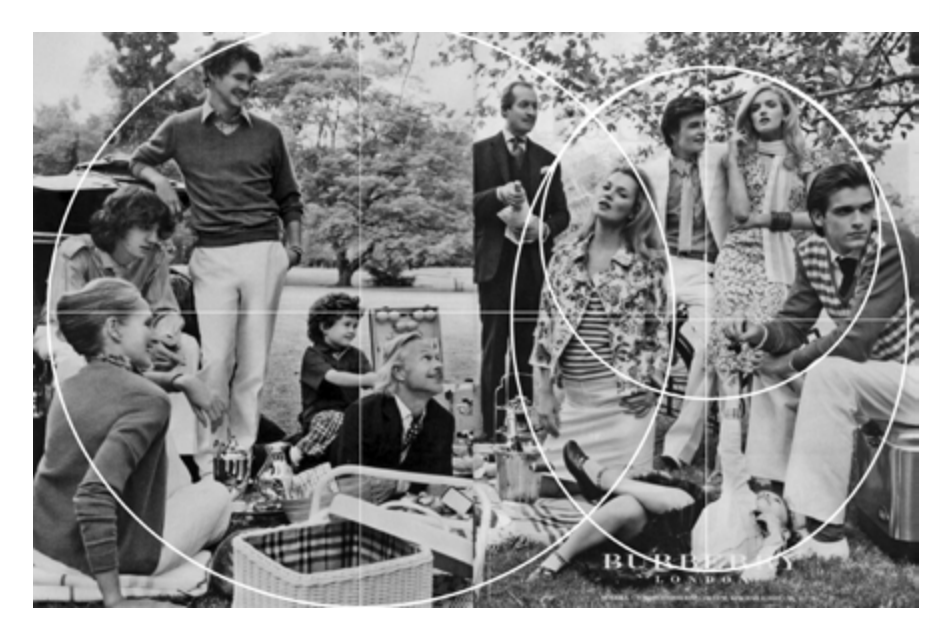
Picture 7. Advertising photo I: Burberry London: planimetry. (lines were drawn by me)

As another example of such a «complexity of meaning characterized by transcontrariness» and as an example of the importance of formal structure, I would like to present a quite different family photo to you (see Picture 6): here we have an advertising photo from the clothing company Burberry, which is meant to target markets in Russia and the USA.