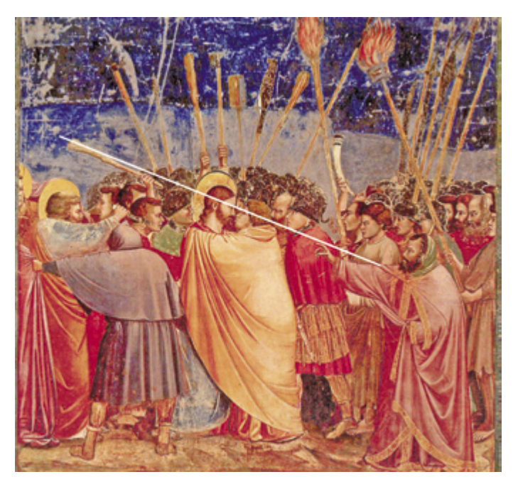
Picture 3. Giotto, The capture of Christ, about 1305. Padua, Arena-Kapelle (from: Imdahl, 1996a, Abbildungsverzeichnis, p. 45, the slanting line was drawn by me according to Imdahl)

The iconic meaning, which is Max Imdahl's term for this deeper semantic structure, has — according to Imdahl — its peculiarity in a «complexity of meaning which is characterized by transcontrariness» (in German: «eine Sinnkomplexität des Übergegensätzlichen») (Imdahl, 1996a, p. 107).