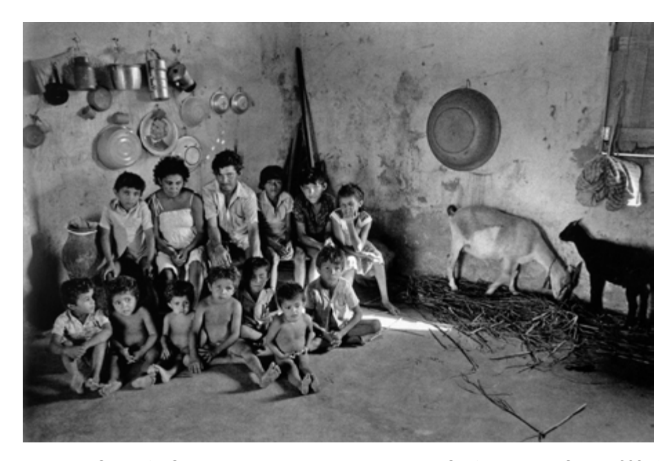
Picture 1 . Sebastião Salgado: Family with eleven children in Sertão de Tauá. Ceará 1983 (from: Sebastião Salgado, 1997, p. 98)