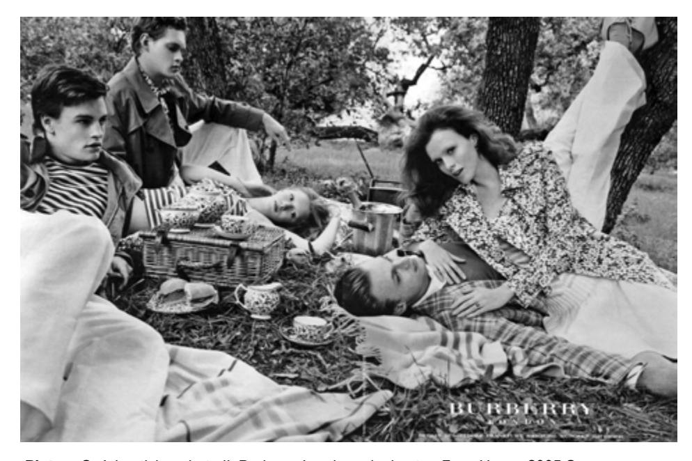
Picture 8. Advertising photo II: Burberry London: planimetry.

However, we recognize that the presentation of individuality and autonomy has taken the specific form of a negation. This is due to the peculiar form of presentation in advertising. Advertising depends on the medium of the pose (see also: Bohnsack, 2007b a; Imdahl, 1996c), the «hyper-ritualization» as Erving Goffman (Goffman, 1979, p. 84) has called it, and is confronted with the paradoxical challenge of expressing individuality through the medium of poses and stereotypes. In our case, this is accomplished through the absence or denial of visual contact. This effect is even more evident in the photo which is intended for the German advertising market (see Picture 8).