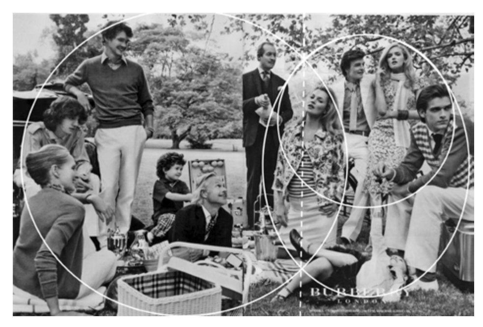
Picture 9. Advertising photo I: Burberry London planimetry and golden section.

Thus the photo demonstrates yet another form of transcontrariness in its iconic or iconological meaning: the presentation of individuality by posing or using stereotyped postures.