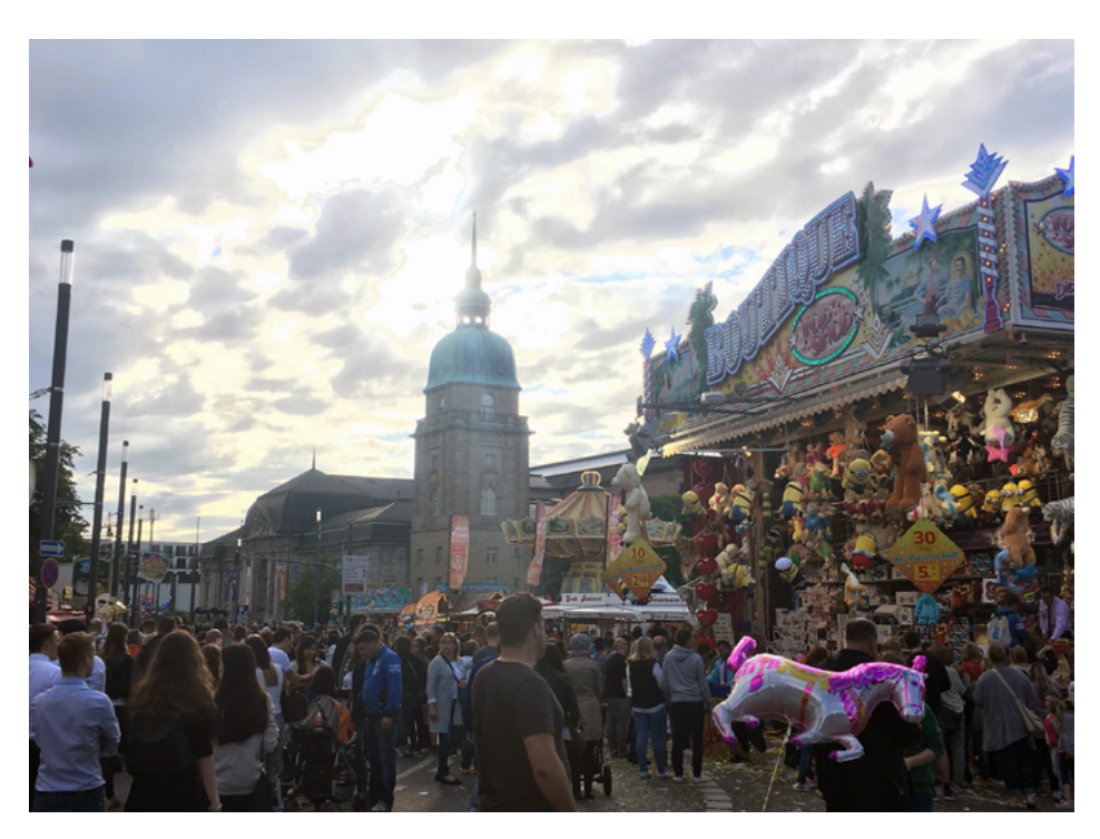
Photo 2. Heinerfest 2016. Darmstadt, Marion-Gräfin-Dönhoff-Platz.