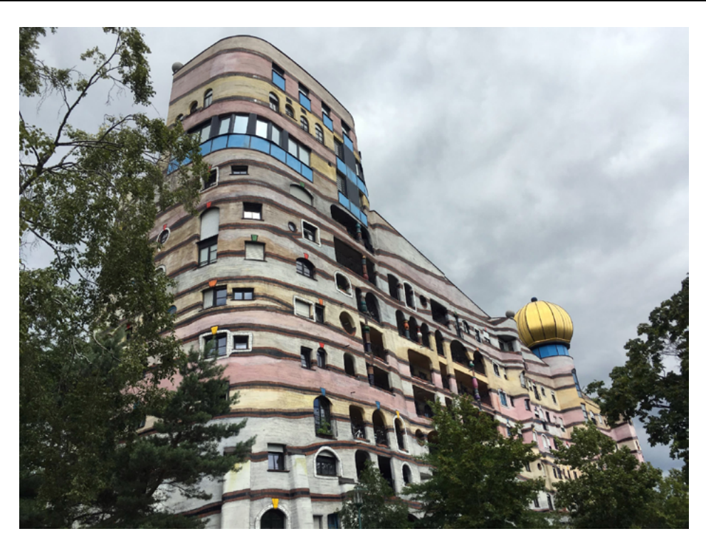
Photo 1. Residential complex by Austrian Friedensreich Hundertwasser "Waldspirale" ("Forest Spiral").

come to the city and that there are no entertainment activities that would be interesting for tourists.